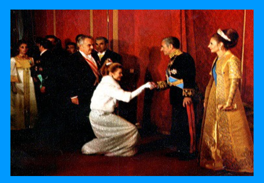
Princess Grace accompanied by Prince Rainier of Morocco.

magnificent military parade was refreshing everyone's mind that Imperial Iranian Armed Forces had 2500 years of history with unblemished record.